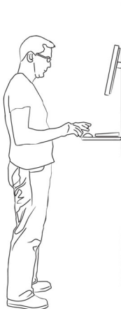
Standing 95 th percentile male

While VDT monitors are predominantly found at seated workstations, in some instances the task will be more suited to a standing posture. Tasks that require a workstation to be used from a standing position need to allow for the same relaxed posture of the head, neck and shoulders that is desirable in a seated one.